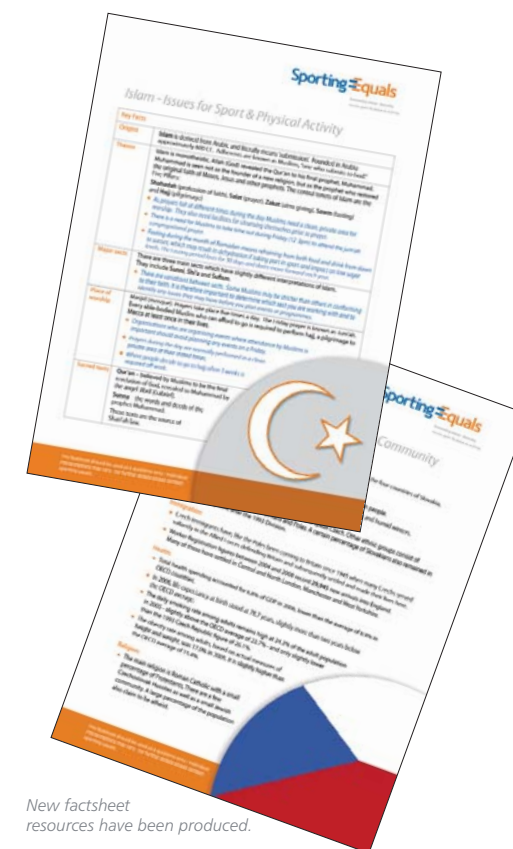
New factsheet resources have been produced.

Sporting Equals will continue to run this project annually. Capturing information around best practice and showcasing projects which have made a significant impact.