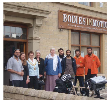
The Bodies in Motion Team

Will raised over £1,000 for Sporting Equals. The money raised will fund the Sporting Equals Best Practice Award.